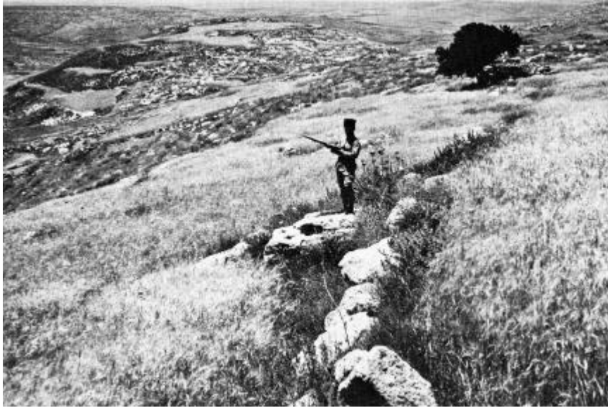
FIGURE 3.—This is a present-day view of a part of the Promised Land to which Moses led the Israelites about 1200 B. C. A few patches still have enough soil to raise a meager crop of barley. But most of the land has lost practically all of its soil, as observed from the rock outcroppings. The crude rock terrace in the foreground helps hold some of the remaining soil in place.

Where soils are held in place by stone terrace walls, that have been maintained down to the present, the soils are still cultivated after several thousand years. They are still producing, but not heavily, to be sure, because of poor soil management (fig. 3).