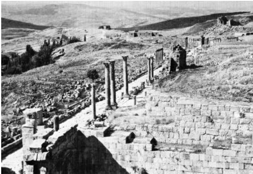
FIGURE 4.—Ruins of one of the Hundred Dead Cities of Syria. From 3 to 6 feet of soil has been washed off most of the hillsides. This city will remain dead because the land around it can no longer support a city.

About 4,500 years ago, we are told by archaeologists, a Semitic tribe swept in out of the desert and occupied the eastern shore of the Mediterranean and established the harbor towns of Tyre and Sidon. On the site of another such ancient harbor town is Beirut, which today is the capital of Lebanon. You can see it from a high point on the Lebanon Mountains overlooking the Mediterranean Sea.