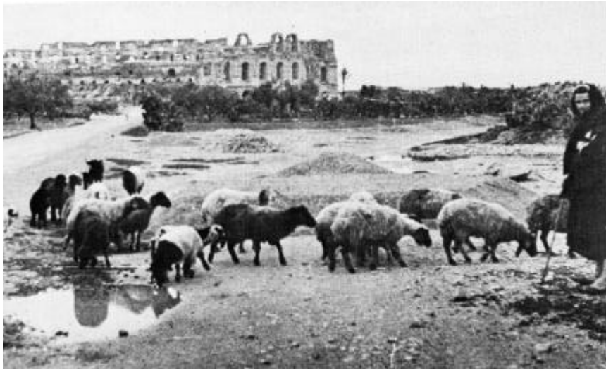
FIGURE 10.—Ruins of the amphitheater at the former city of Thysdrus, in Tunisia, which would seat 60,000 people. Today, only a few thousand people inhabit this area. The small flock of sheep in the foreground are a fair indication of the land's ability to support life.

So Director Hodet of the Archaeological Excavations at Timgad decided as an experiment to plant olive trees on an unexcavated part of the city where there would be no possibility of subirrigation. He planted young olive trees in the manner prescribed in Roman literature, watering them in the following two long dry summer seasons. These olive trees are thriving, indicating that where soils are still in place, olive trees will grow today probably very much as they did in Roman times.