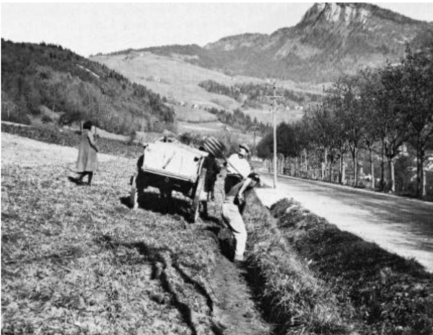
FIGURE 12.—These French farmers are digging up the soil along the lower furrow of their field and loading it into a cart. It will be hauled uphill and spread along the upper edge. They do this job each winter to help compensate for the downhill movement of soil by erosion.

were built on the contour to form level benches. At other places, farmers dug up the soil of the bottom furrow of their fields that were laid out in contour strip crops, loaded the soil into carts, hauled it to the upper edges of the fields, and dumped it along the upper contour furrows to compensate for downslope movement of soil under the action of plowing and the wash of rain (fig. 12). This was done each year. Where the slope was too steep to haul the soil uphill, they loaded the soil of the bottom furrow in baskets and carried it on their backs to the upper edges of the field. In this way these farmers of France take care of their soil from generation to generation.