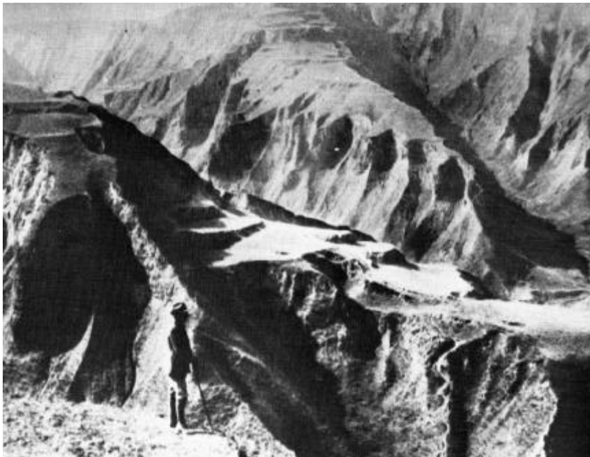
FIGURE 8.—These huge gullies indicate the severity of soil erosion in the deep, and once fertile loessial soils of northern China. Millions of acres have been cut up like this and are now almost worthless.

Let's now go back and follow the westward course of civilization from the Holy Lands through North Africa and on into Europe. In Cyprus we found the land use problems of the Mediterranean epitomized in a comparatively small area.