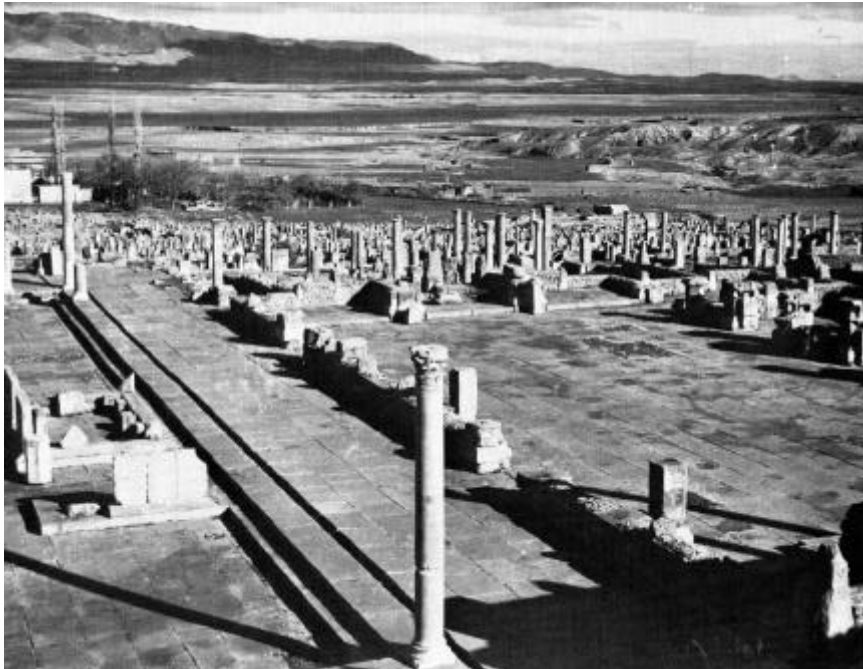
FIGURE 9.—The ruins of Timgad—an ancient Roman city built during the first century A. D. The few huts seen in the center background now house about 300 inhabitants, which is all the eroded land will support. Note that the eroded hills in the background are almost as desolate as the ruins of the city.

After the invasion of the nomads in the seventh century had completed the destruction of the city and dispersal of its population, this great center of Roman culture and power was lost to knowledge for 1,200 years. It was buried by the dust of wind erosion from surrounding farm lands until only a portion of Hadrian's arch and 3 columns remained like tombstones above the undulating mounds to indicate that once a great city was there.