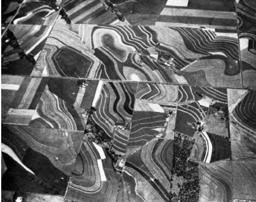
FIGURE 16.—This airplane view shows parts of six different farms near Temple, Tex., where the farmers have banded together to combat erosion as a community problem.

Now Gowder is cultivating topsoil on slopes up to 17 percent whereas his ridiculing neighbors have only subsoil to farm. They have lost all their topsoil by erosion.