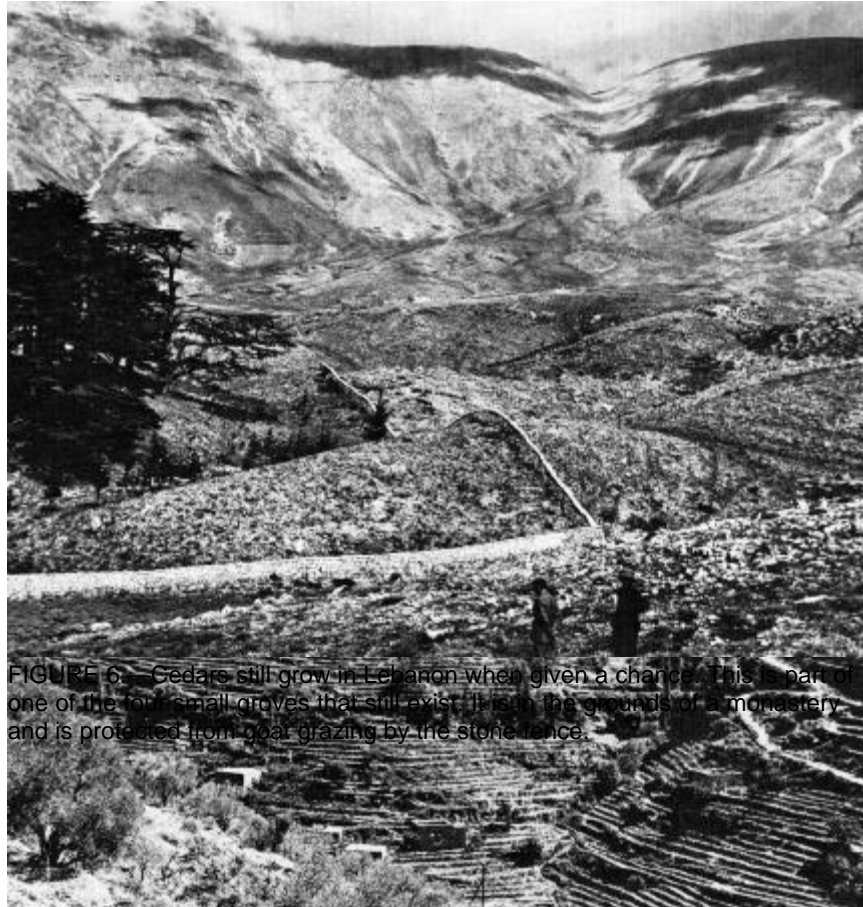
FIGURE 6.—Cedars still grow in Lebanon when given a chance. This is part of one of the four small groves that still exist. It is on the grounds of a monastery and is protected from goat grazing by the stone fence.

The mountains of ancient Phoenicia were once covered by the famous forests, the cedars of Lebanon. An inscription on the temple of Karnak, as translated by Breasted, announces the arrival in