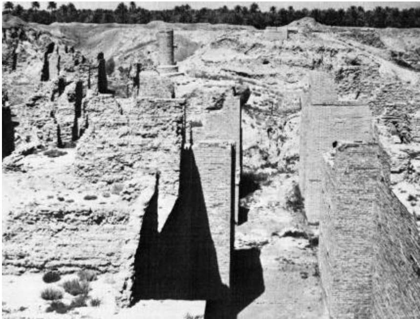
FIGURE 2.—Ruins of the famous stables of Nebuchadnezzar in Babylon built during the sixth century B.C. Babylon died and was buried by the desert sands, not because it was sacked and razed but because the irrigation canals that watered the land that supported the city were permitted to fill with silt.

That which no king before had done, I did . . . A wall like a mountain that cannot be moved, I builded . . . great canals I dug and lined them with burnt brick laid in bitumen and brought abundant waters to all the people . . . I paved the streets of Babylon with stone from the mountains