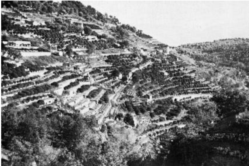
FIGURE 11.—A terraced citrus orchard in southern France. It is believed that terraces of this type were first built in France by the Phoenicians about 2,500 years ago. Modern French farmers are still maintaining and farming such hillsides, however, because of the scarcity of good land.

We found slopes in southern France cultivated on gradients up to 100 percent with terrace walls as high as the benches were wide. Some of these terraced fields had been under cultivation for more than a thousand years—likely much longer, for the Phoenicians are believed to be responsible for terracing in this part of France (fig. 11).