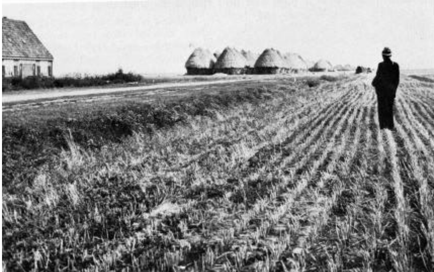
FIGURE 14.—A Dutch farm in the Wieringermeer Polder of the Netherlands. Only 7 years before this picture was taken this land was covered by the North Sea.

If the United States were as densely populated per square mile of cultivated land as Holland, the population of the United States would be 1 1/4 billion. The density of population of Holland has called for an increase of its land area.