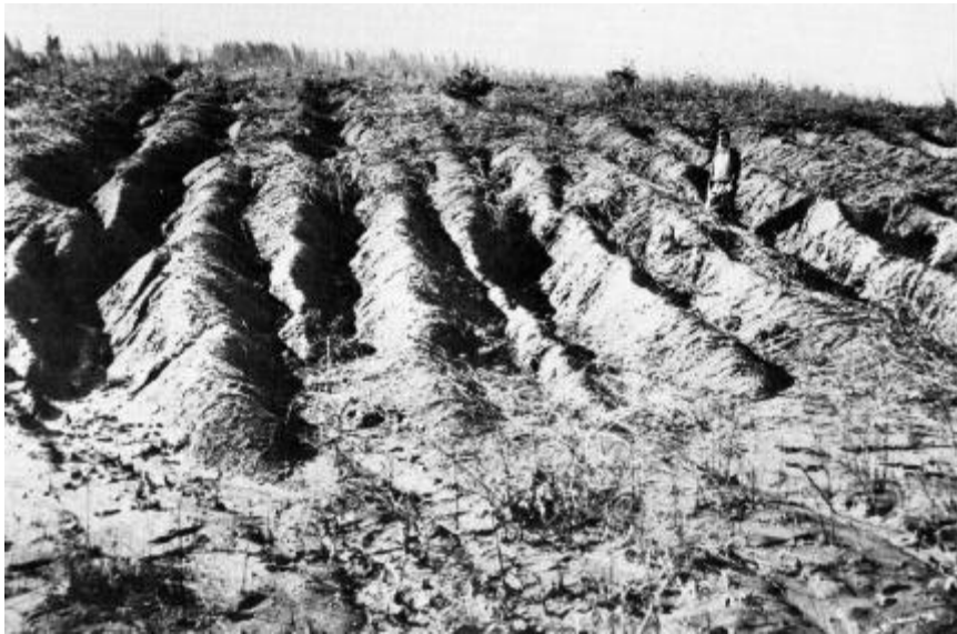
FIGURE 15.—A formerly productive field in Virginia that has been cut to pieces by gully erosion. About 50 million acres of good farm land in the United States have been ruined for further practical cultivation by similar types of erosion.

A solution to the problem of farming sloping lands must be found if we are to establish an enduring agriculture in the United States. We have only about 100 million acres of flat alluvial land