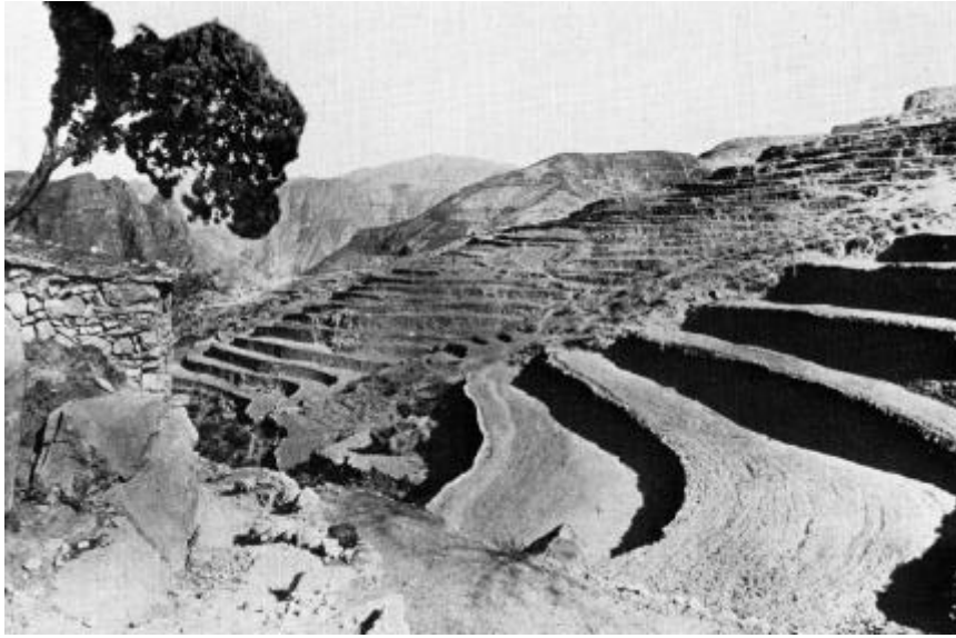
FIGURE 7.—These bench terraces in Shansi Province illustrate the extent to which some Chinese farmers have gone to conserve the remaining soil on their hillsides.

which is the Tripoli grove of trees in the cup of a valley. An examination of the grove revealed some 400 trees of which 43 are old veterans or wolf trees. As we read the story written in tree rings, it appears that about 300 years ago the grove had nearly disappeared with no less than 43 scattered veteran trees standing.